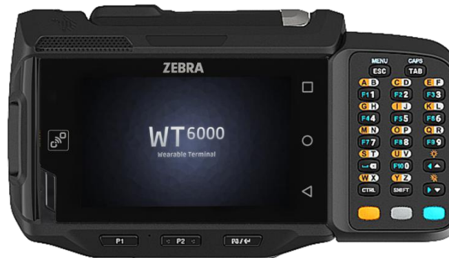
WT6x with Attached Keypad